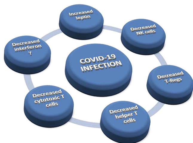
Fig. 2. Some elements in immunological profiles of patients with COVID-19 infection.

report, the use of antimalarial drugs have been recommended for prophylaxis and treatment of high-risk individuals with SARS-CoV-2 infection [32]. Allitridin (Allyl trisulfide) can promote cytomegalovirus (CMV)-induced Treg expansion and Treg-mediated anti-CMV immunosuppression. Therefore, allitridin may be useful as a therapeutic agent fighting against CMV [34].