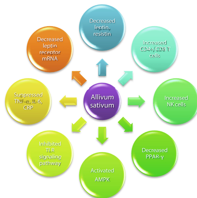
Fig. 3. The effects of garlic ( Allium sativum ) upon biological and immunological components of the systems.

Leptin secreted from adipose tissue stimulates AMPK in the liver. AMPK phosphorylates acetyl CoA carboxylase. The phosphorylation